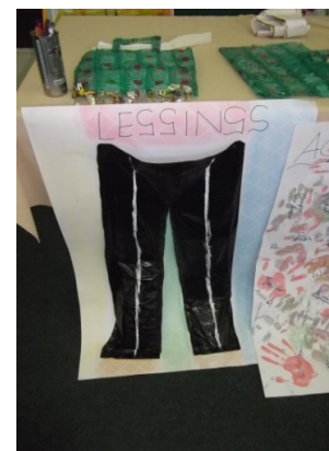
Making fashionable items from waste!