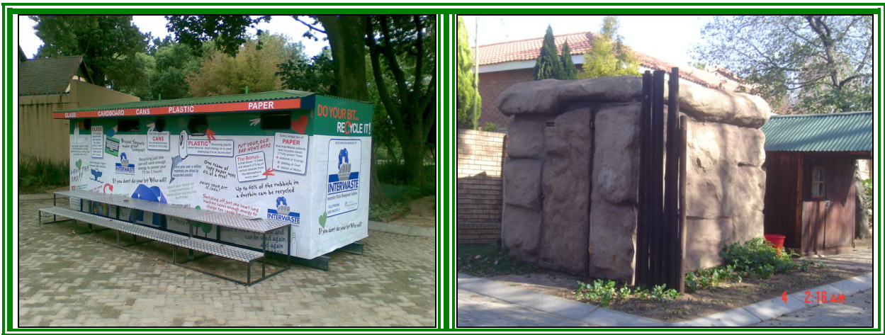
Photos above: The Blue Gill multi material (paper, cardboard, glass, cans and plastics) container on the left and the E-waste (electric and electronic waste) container on the right.

Recycling is no longer what your bleeding heart neighbour does. Every household – offices and factories too – should be making recycling a habit. It's no longer a question of whether resources will run out, but when. And scientists concur – climate change is happening. Major lifestyle changes – building green homes or living off the grid – are not yet necessary, but if you're not already recycling, you're being irresponsible.